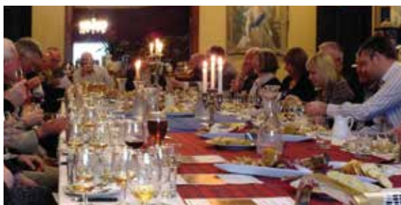
A record number attending our Club Whiskey Tasting