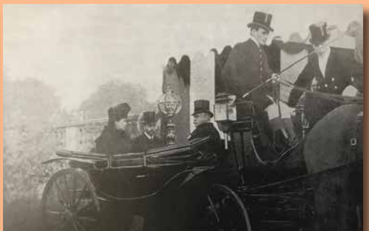
The Duke and Duchess of Cornwall about to leave the Club in an open carriage on 26 June 1901. (Otago Witness 9 July 1902)