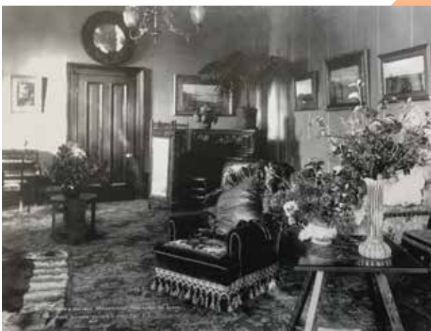
The drawing room used by the future Queen Mary during the 1901 Royal Visit (Otago Witness 9 July 1901)