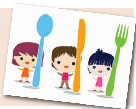
Table top crafts and games will be available to help entertain the little ones - while a child friendly menu will also be available. When making your reservation, please inform the Club on number of children attending.

As part of our regular Friday Cafe Bar Dinner